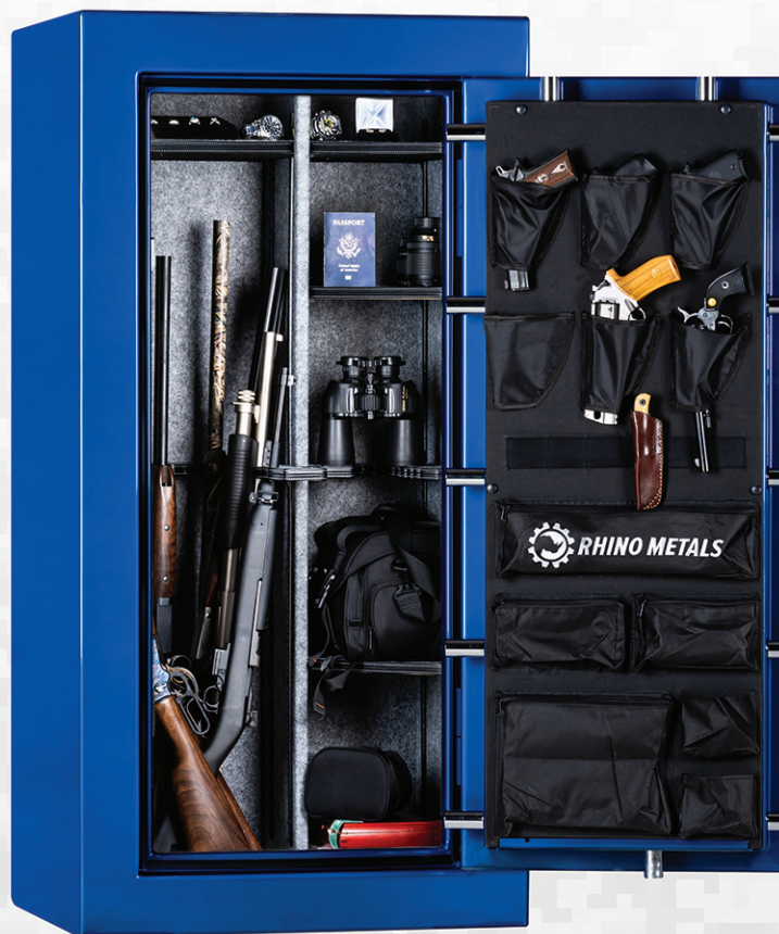
Model CD6030XGL in Gloss Blue Finish Upgrade Shown: U.L. Listed Electronic Lock

Available Upgrades: Swing Out Gun Rack (Includes Rifle Rods) Factory Installed LED Lighting Executive Shelving Kit U.L. Listed Electronic Lock U.L. Listed Biometric Lock with Keypad Back-up Two-Tone Gloss (Excludes Black and Pearl White)