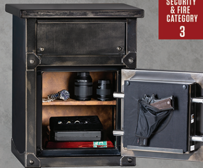
Model LNS2618 Nightstand / End Table Safe